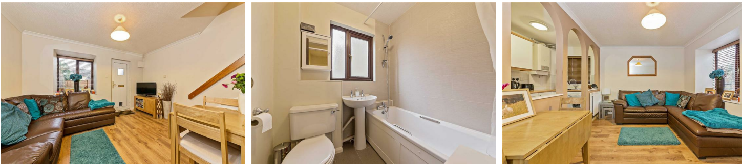
Ground Floor Approx. 20.1 sq. metres (216.2 sq. feet)

Maintained to an impeccable standard, this one double bedroom end of terrace Freehold house offers a surprising amount of living accommodation and is simply perfect as a 'first step' on the property ladder. Features include a private rear garden and allocated parking. Situated within easy access of St.Albans City Centre and mainline train station plus excellent shops, amenities, eateries are close by as well as the popular Quadrant. Nestled in a quiet cul de sac Harness Way is located in the heart of Jersey Farm which is positioned on the north east side of the city.